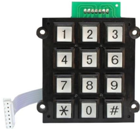
Diagram 2: Keypad model HQ-JWAT

Please follow these steps to program the auto dial number on your phone models HQ-JWATXXX: